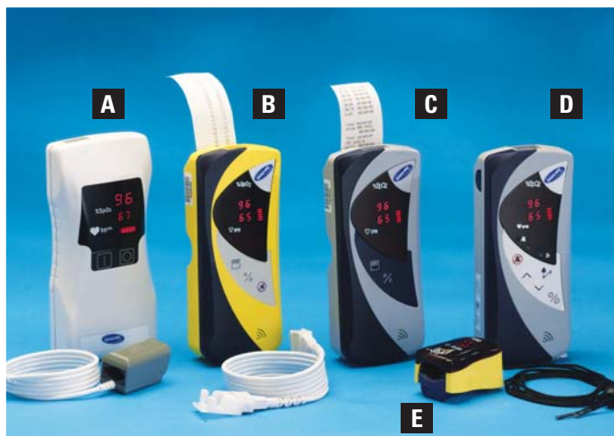
(A) IRC700 (B) IRC725 (C) IRC735 (D) IRC775 (E) IRC600

Invacare offers an extensive line of pulse oximetry solutions. These high-performance patient monitoring systems provide fast, accurate readings. They're lightweight, completely portable and engineered for durability. When you want respiratory monitoring in a home care setting, Invacare has the products that fit your needs.